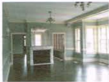
YSU President's House: Interior

In 2009, Faniro Architects, Inc. was selected by the YSU Board of Trustees to design and monitor the restoration of this landmark site for use as the University President's House. Utilizing much of the building's historic fabric, the ground floor is designed to accommodate University social functions while the second level provides a more intimate suite of rooms for the President's everyday living. Changes to the original property included the addition of an attached garage tucked into the site's slope, the top of which is a formal terrace adjacent to the dining room, and a comprehensive redevelopment of the landscape into a series of lawns, terraces and gardens. A combination of design approaches including preservation, restoration, and reconfiguration were used to affect a facility that respects the site's history while creating a place for contemporary entertaining and living.