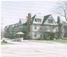
YSU President's House before as a hotel (above) and after redevelopment (right)

Project: Pollock Estate Redevelopment Project Location: Youngstown State University Youngstown, OH Size: 17,000 SF Completion: August 2012 Project Cost: $4,400,00